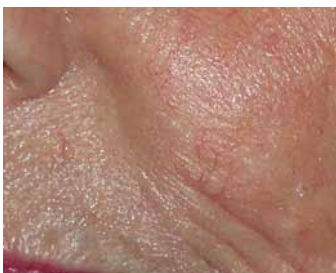
Photo Facial Rejuvenation

This treatment produces a fresher, brighter and plumper complexion. Collagen production is stimulated; pigmentation and thread veins are improved; and fine lines are softened. This creates a more even skin tone and finer overall texture. 4 treatments are advised, spaced 6 – 8 weeks apart.